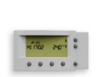
TERMET ST-292 V2