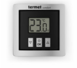
TERMET ST-292 V2