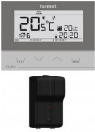
TERMET ST-292 V2