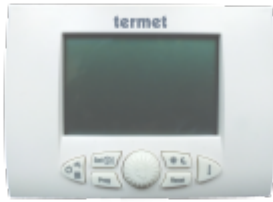
TERMET ST-292 V2