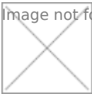
BASIC PACKAGE "COMFORT SYSTEM"